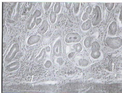
Fig 1- Lymphoplasmacytic gastritis: cellular infiltration (1) (H & E, \times 400 )