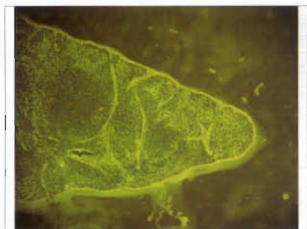
Fig.1: Group A - Spleen of mouse received casein on 7th week of treatment . Amyloid density scale is 3. Extracellular deposition of amyloid protein characterized by apple green birefringence. Congo red stain \times 10 .