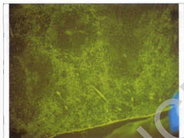
Fig. 3: Group C - Spleen of mouse received AgNO 3 , on 7th week of treatment . Amyloid density scale is 3. Extracellular deposition of amyloid protein characterized by apple green birefringence. Congo red stain \times 10 .