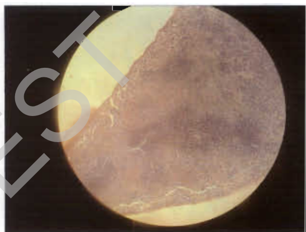
Fig.4: Group D - Spleen of mouse received Normal Saline, on 7th week of treatment . Amyloid density scale is 0. Congo red stain \times 10 .