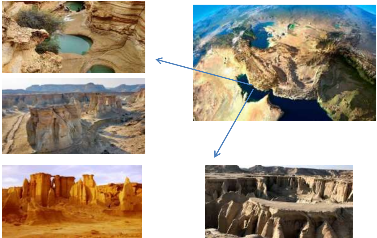
Fig1. Distribution of geomorphological phenomena in Gheshm geopark

must offer Geo-tourism courses, and recruit tourism geoscience graduate students .The tourist geography education, textbook and training rented gradually, provide support for the development of the industry. (Guo,et al.,2011)