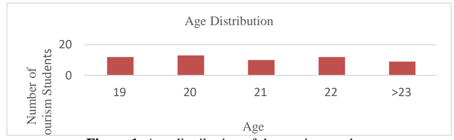
Figure 1. Age distribution of the tourism students

Figure 1 illustrates the distribution of the learners based on their ages. Their age range start from 19 with 12 students to 37 who is the oldest. 84% of the learners are younger than 23 years old. The average age of the learners is 21.65 and the standard deviation is 1.93.