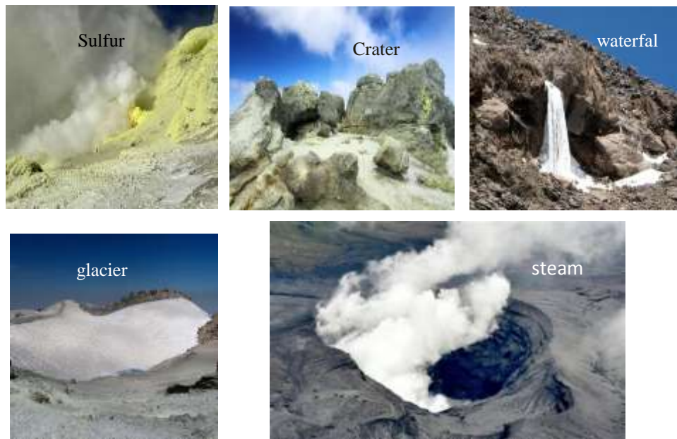
Fig 2. Images of Mount Damavand with related phenomena