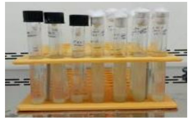
Figure1. Tubes that content 9k culture fluid and Acidithiobacillus Ferrooxidans Bacteria

The pH of H<sub>2</sub>SO<sub>4</sub> was set to 2 and 3. After the provision of 9k, in the next step, the medium was prepared for growing Acidithiobacillus Ferrooxidans (A.F). For every 10cc of the medium, 300µcc A.F was added. Then 20cc of the medium was poured inside the tubes with 25cc capacity. After that 600µcc A.F was added to the medium by Sampler 1000 tool. As can be observed from the Figure (1), two samples with pH=2, two samples with pH=3 and one tube with 20cc of the medium and without A.F were prepared.