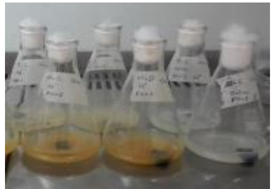
Figure 2. Erlens that content 20cc culture fluid with and without Bacteria after one week growing