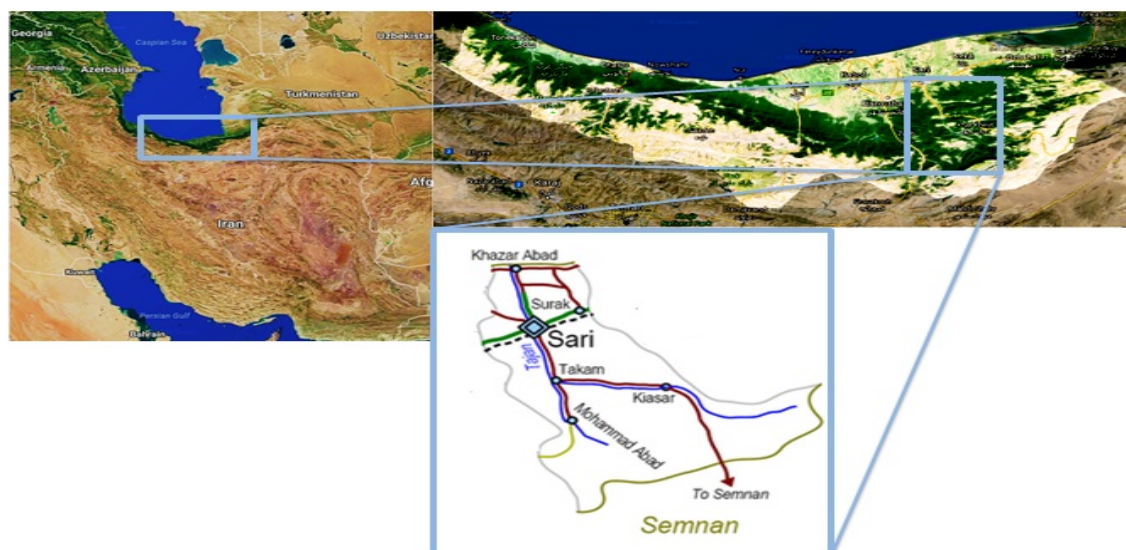
Fig. 2. Map of the study area (city of Sari) (Google Earth).

The material of the study consisted of sub-Hyrcanian native tree species collected from the nine vegetative areas and the paths to these areas (Fig. 2) in the city of Sari according to the administrative divisions of Iran's map in 2010 to consider the changes of contributing factors of the study based on the differences in the vegetation regions such as dense forests, springs, scattered forests, rivers and relatively dry ecosystems. All considered areas of this research are located in geographic district of Sari (Table 1). The geographical position of Sari is between the longitudes of 52° 56' and 53° 59' east and latitudes of 35° 58' and 36° 47' north with the average annual rainfall of 642 mm, average temperature of 5.18°C and relative humidity of 82-64% (Yaghoubi et al. , 2014).