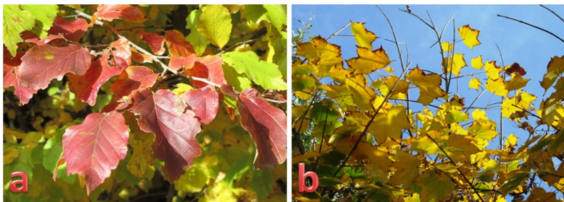
Fig. 1. Change of leaf color in Parrotia persica (DC.) C. A. Mey (a) and Acer cappadocicum Gleditsch (b) in autumn - native tree species of Hyrcanian forest (Source: Authors).

According to the principles of color psychology, social and cultural infrastructure, indigenous knowledge, and some other features, landscape designers use different colors in landscape designing. Thus, the plant pigments that color the leaves, flowers and fruits of plants have a high aesthetic value from architects' point of view (Kaufman and Lohr, 2004). The beauty of man-made landscapes depends on appropriate application of the colors within the layout. Generally, red, orange and yellow are warm colors which are used in the design of gardens and landscapes to provide a happy environment and diversity in different seasons of the year. On the other hand, green and blue are classified as cool colors used to show garden and landscape larger (Rouhani, 2015). The flourish and parade of colors is impressive, especially in spring and autumn (Khoshkhoui, 2015). In cold and temperate regions, autumn is one of the best seasons of the year when the leaf color change is very amazing and spectacular. In some parts of the temperate regions of the world, deciduous forests are very profitable because of their tourism importance (Homayoun and Mahdikhani, 2016). The color of about 15 percent of tree species in temperate zones changes in autumn, but this ratio may be even higher depending on the species occurring in every forest (Archetti et al. , 2013). So, the change of leaf color in autumn can be considered as their visual potential in landscape.