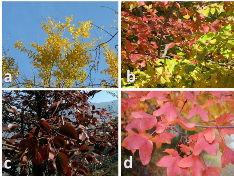
Fig.4. Some outstanding species of first group are (a) Punica granatum L., (b) Parrotia persica (DC.) C. A. Mey., (c) Pyrus boissieriana Buhse, and (d) Acer monspessulanum L.

In the second group are trees that provide beautiful landscape in autumn, and compared with the first group, they have earned lower score. For example in Rosa canina L. S. Str. color change in hip fruit in autumn beautifies it and in terms of leaves' beauty, this plant's score is not high. Other tree plants in this group such as Albizia julibrissin Durazz, despite the lack of beautiful color change in leaves due to the durability of legume fruits are considered because of their elegant form of umbellate branching pattern. Oak species have leaves' color change in autumn but the attractiveness of their color change is not as much as first group's trees.