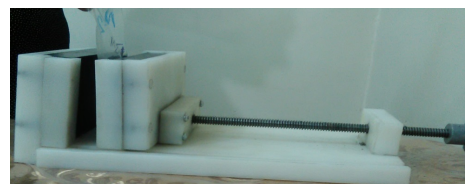
Fig. 2. Magnetizing machine and the application of the treatments.

Where; GP shows the germination percentage, n shows the number of seeds germinated at the final day, and N shows the total number of planted seeds.