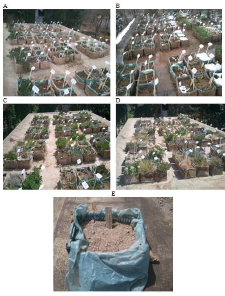
Fig. 1. Experimental trials planned for this study in a four season glance along with control treatment, a) Autumn, b) Winter, c) Spring, d) Summer and e) Control.

where m is the mass of soil, c is the soil specific heat (wet soil, 14.8 J/Kg °C), \Delta T is change in temperature and x depends on the type of vegetation and q (Joule) is the heat energy gained or lost by a substance (q<sup>1</sup>, green roof and q<sup>2</sup>, non-planted bare roof). The differences in heat gain or lose ( \Delta q) Kcal h<sup>-1</sup> of each roof type will be achieved in this way.