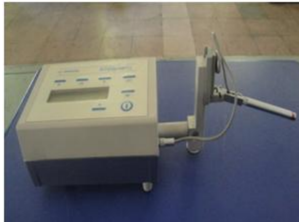
Fig. 3. Surface roughness tester used.