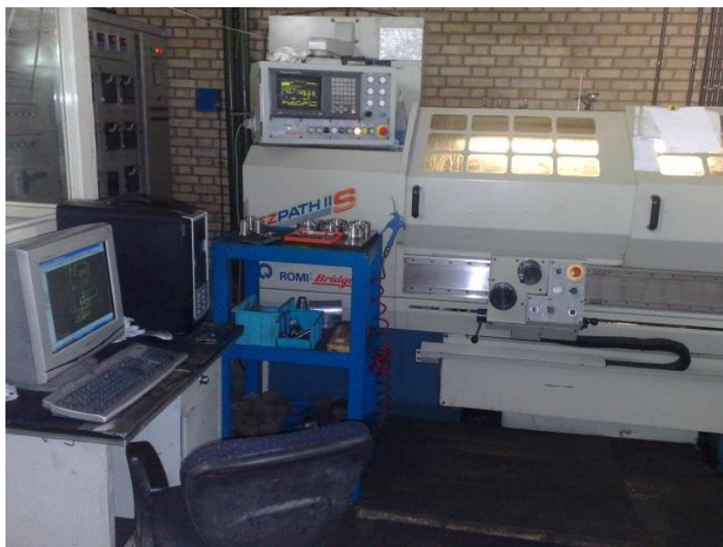
Fig. 2. CNC lathe machine used for experiments.

Cutting tests were carried out on CNC lathe machine under dry conditions. In total 8 work pieces are prepared. These work pieces were cleaned prior to the experiments by removing 0.5mm thickness of the top surface from each, in order to eliminate any surface defects and wobbling. Two different nose radii of CVD coated inserts have been taken to study the effect of tool geometry. The roughness of machined surfaces is measured by a Surtronic 3+ surface roughness tester (Fig. 3) and measurements are repeated 3 times. The experimental design and results are given in Table 2.