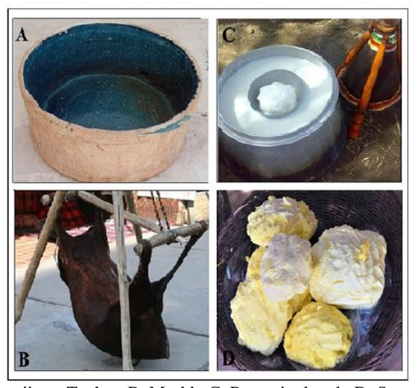
Fig. 1. A. Lanjin or Taghar, B. Mashk, C. Butter in doogh, D. Separated butter A. Taghar is a relatively large earthenware vessel in which liquids such as water and yogurt or grains such as wheat and barley are poured. It has also been used to grind Kashk. B. Mashk is a leather container made of sheep, goat, and calf tanned skins that is used to transport water, doogh, oil, etc. among tribes and nomads.

( Ferulago angulata ) is sometimes added (Figures 2C and 2D). This herb is green to dark green, with a pleasant flavor, belonging to Apiaceae (Rafieian-Kopaei, Shahinfard, Rouhi-Boroujeni, Gharipour, & Darvishzadeh-Boroujeni, 2014).