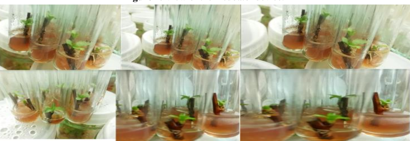
Figure 3. Growth process of samples in tissue culture medium.