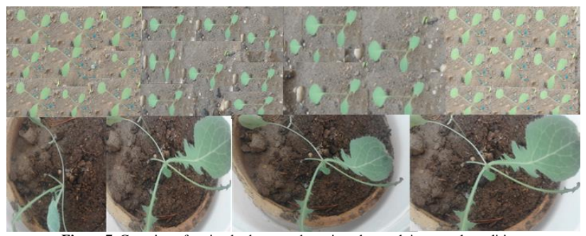
Figure 7. Greening of grainy barberry and continued growth in natural conditions