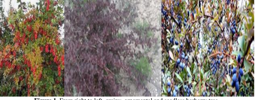
Figure 1. From right to left, grainy, ornamental and seedless barberry tree.

So, the samples were prepared and sterilized and their cultures were then transferred to the growth chamber and placed under cold white fluorescent lamps at a temperature of 21 degrees Celsius and light conditions of 16 hours of light and 8 hours of darkness, and then the samples were treated with growth hormones. They were stimulated to grow. In this study, the characteristics of germination, number of leaves, length, width and surface of leaves, ratio of width to length of leaves, wet and dry weight of leaves on day 30 were (Figures 2 and 3).