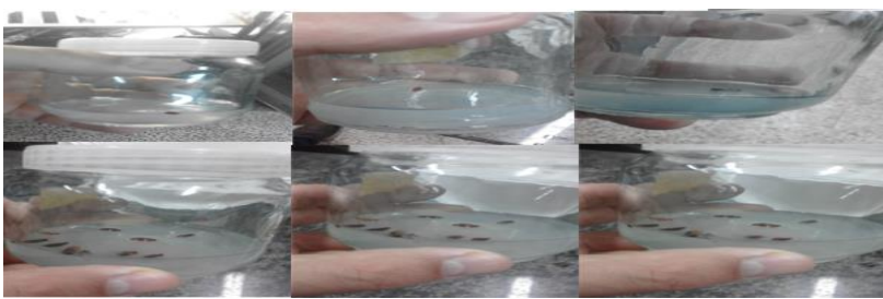
Figure 6. Placement of grainy barberry seed in tissue culture medium