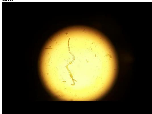
Figure2: Oxyuris equi adult worm (magnification \times 40 ).