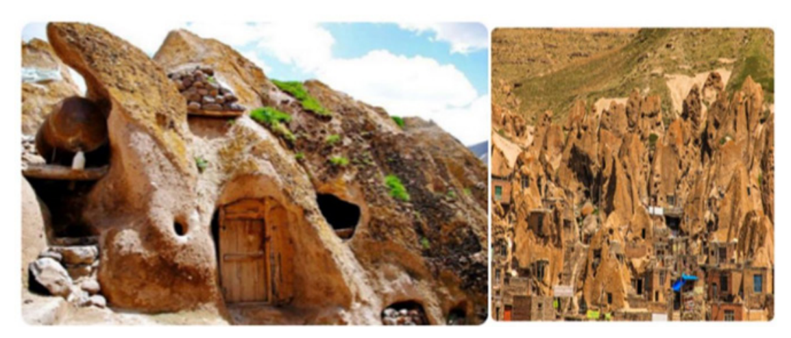
Figure 6. Ston house at Kandovan

castle is an old noble building that belonged to the lord of the village and a person named Mehri Khanum. Mehri Khanum Castle is located 100 m south of the village. It overlooks the village and is surrounded by the green bed of the foothills and the view of the castle is beautiful (Fig 4).