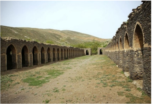
Figure 3. Horse breeding stable, Varkaneh vilage