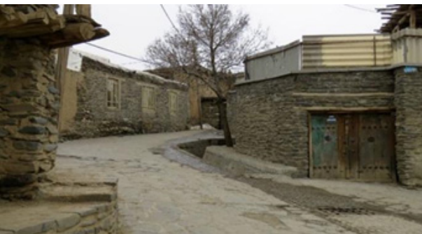
Figure 2. Ston House at Varkaneh village