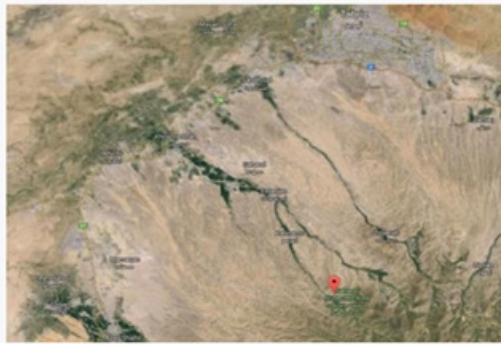
Figures 5. Aerial photos of Kandovan