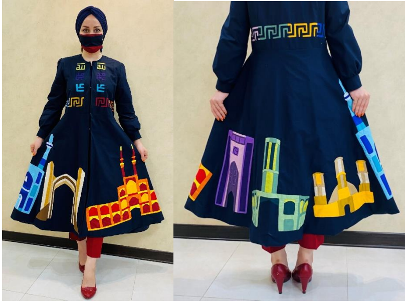
Figure8. The final sewing of the skirt