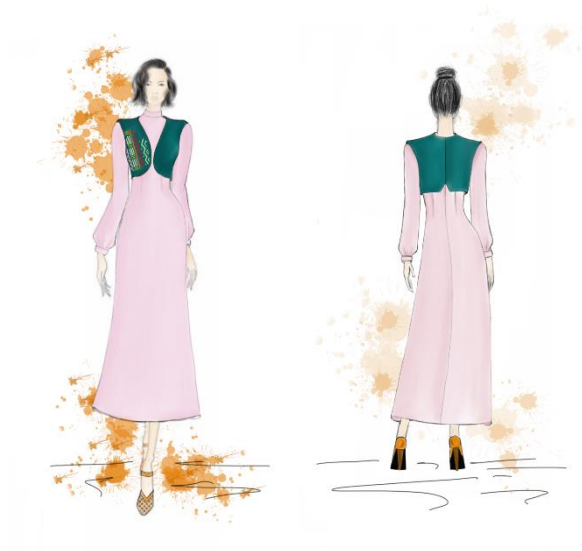
Figure2. The final color design of the vest

After research, the method of performing this art was studied and adapted to traditional Iranian art and design so that it could be presented as an idea to the Iranians. Eutods were made, two of which were presented as the final design in the form of a vest and skirt. The implementation procedure is as follows.