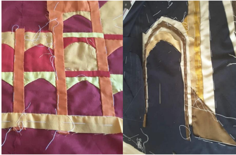
Figure6. The stages of sewing a shirt using the Mola technique