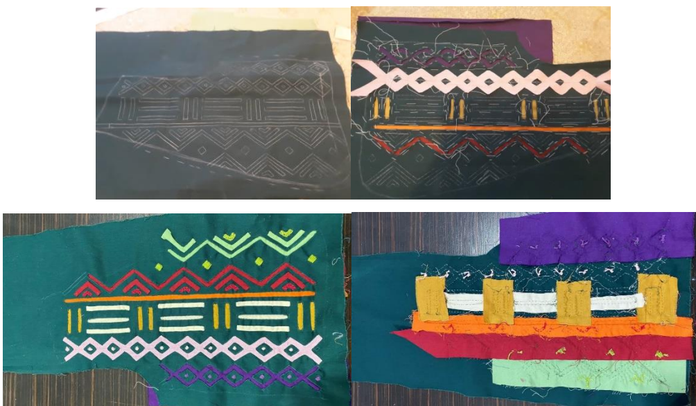
Figure5. The stages of sewing a vest using the Mola technique