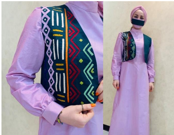
Figure7. The final sewing of the vest