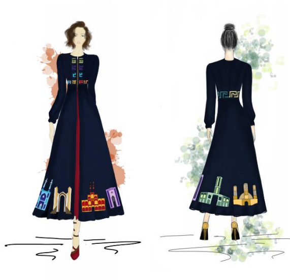
Figure3. The final color design of the skirt