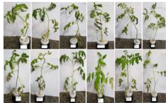
Fig. 1. Effect of NaCl and SNP (mM) treatments on tomato plants after 20 days (Left to Right); Top row: control, 40 mM NaCl, 80 mM NaCl, 120 mM NaCl, 50 mM SNP, 50 mM SNP, and 40 mM NaCl; Bottom row: 50 mM SNP and 80 mM NaCl, 50 mM SNP and 120 mM NaCl, 100 mM SNP, 100 mM SNP and 40 mM NaCl, 100 mM SNP and 80 mM NaCl, and 100 mM SNP and 120 mM NaCl