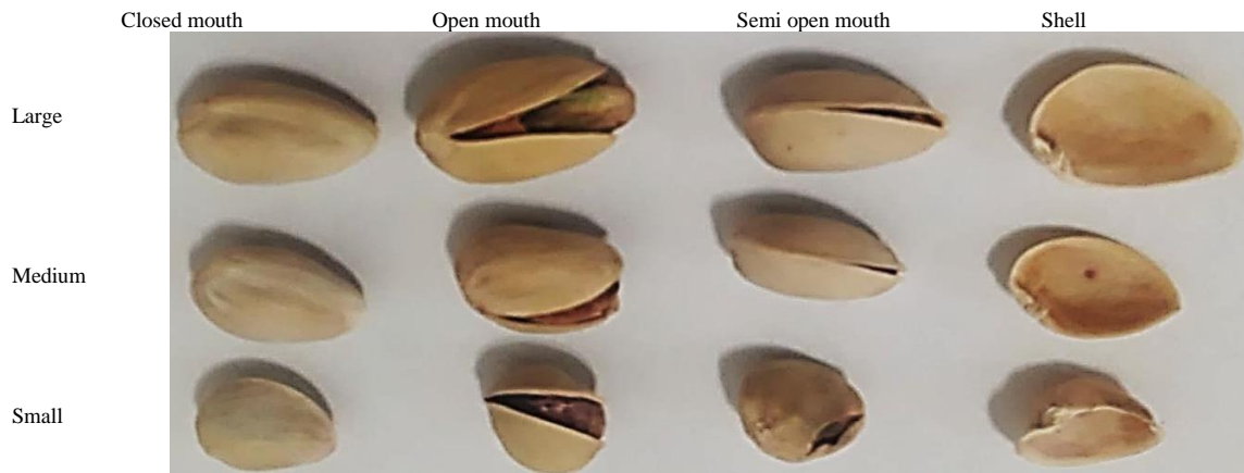
Fig. 1. The pistachio nuts with different sizes and mouth statuses.

the experts. The samples were first classified into four groups: closed mouth, open mouth, semi-open mouth, and shell. Also in each group, the samples were divided into three groups: small, medium, and large (Fig. 1).