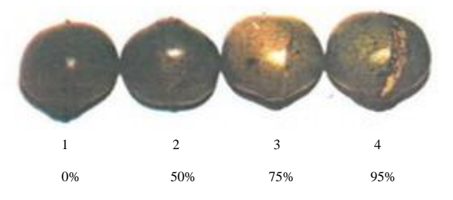
Fig. 2. Samples of fruits treated with different concentrations of acetylene