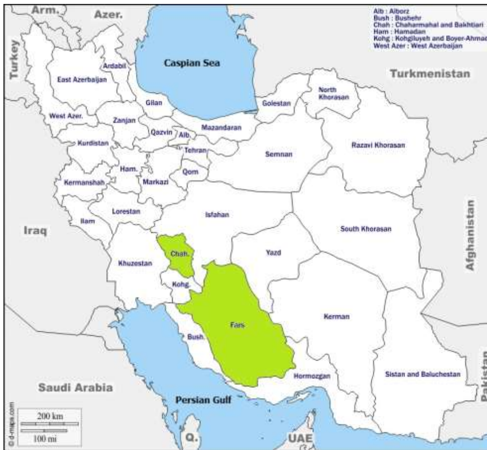
Fig. 1. Approximate distribution of almond species and populations habitats in Iran that used in this study (the green colored provinces). The original map is obtained from d-map ( https://d-maps.com/carte.php?num_car=5496&lang=en ) and modified (colored) using paint software of Microsoft Windows