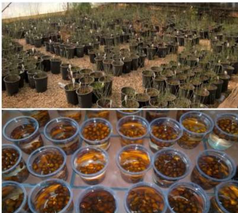
Fig.2. Nut samples soaked in water to be used in raising seedlings (down) and raised seedling after one year of growth in greenhouse condition (top).

was measured after drying samples for 72 h at 70°C, using an electronic balance with 0.001 g precision. Leaf ash weight was also measured after subjection samples to 500 °C for 4 h in an electric oven. Leaf area (mm 2 ) was determined using a leaf area meter (Delta-T devices, Ltd., Cambridge, UK).