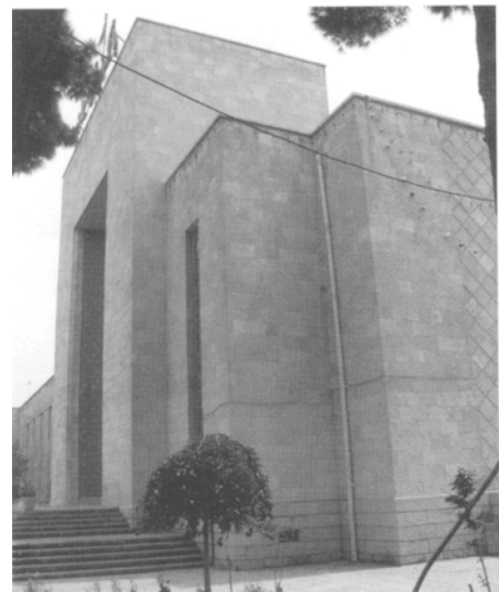
Fig. 8: Isfahan National Bank, by Mohsen Foroughi, 1942 (Source: Bani masoud, 2009)