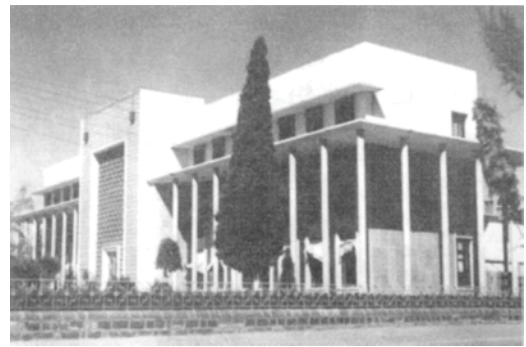
Fig. 2: Iranian National Bank by Mohsen Foroughi, Shiraz