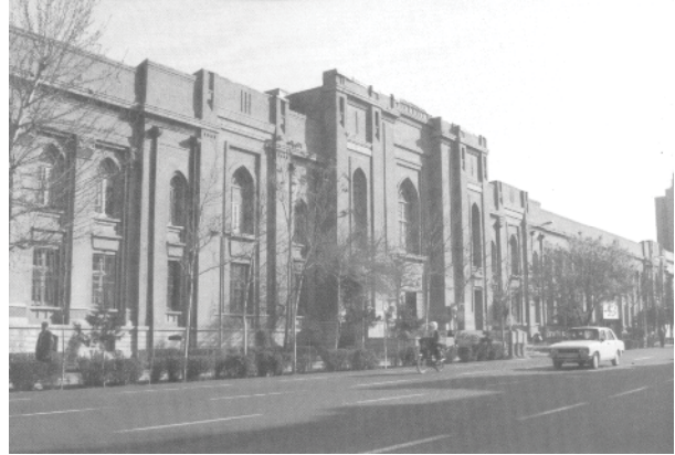
Fig. 4: Central Post office, by Nicholai Markov Tehran, 1934

In revival of and exploitation from ancient oriented architectural works.