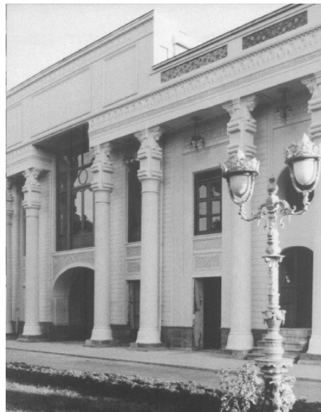
Fig. 6: North side of National consultative Assembly by Karim Taherzadeh Behzad, Tehran,1936