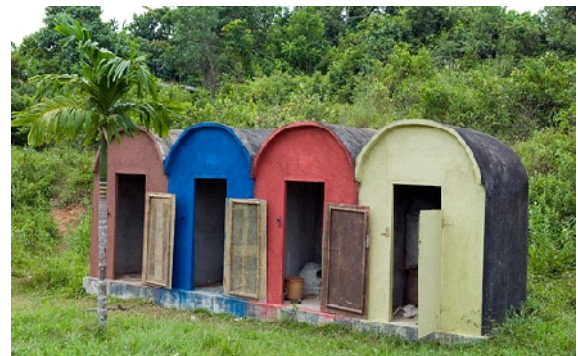
Fig.6: The edge of town recycling station emptied monthly in Sarvodaya