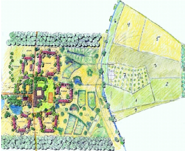
Fig.11: Site plan of Munksøgaard