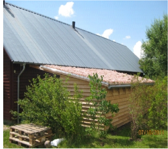
Fig.12: Use of green roof in Munksogaard

pressure on existing waste treatment facilities (Ibid).