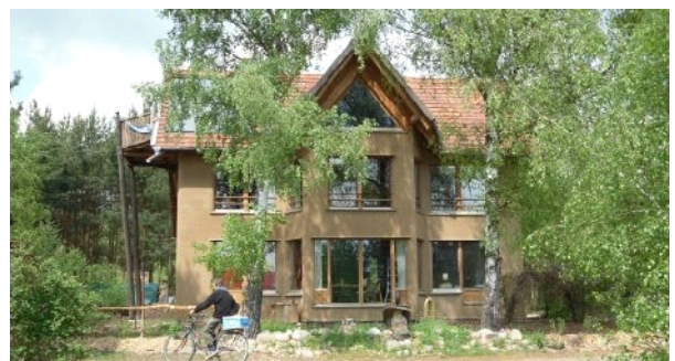
Fig.18: One Type of buildings in Sieben Linden