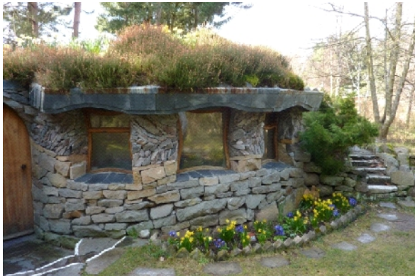
Fig.1:One house in Findhorn Eco-village.