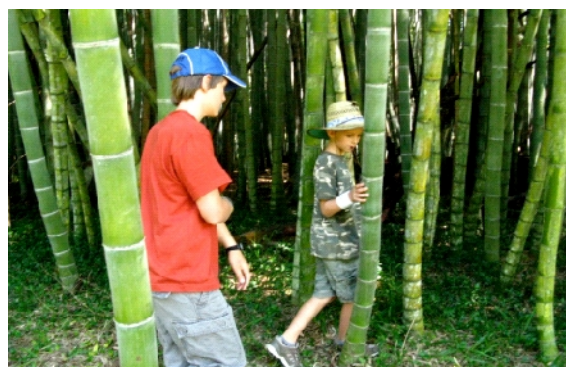
Fig.21: Use bamboo in Crystal water

Use of recyclable, local and non toxic materials is very important. Material must have the ability to use multiple times.