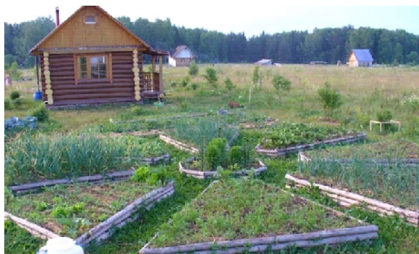
Fig.19: Vegetable garden in Kovcheg

As a result of comparing ecovillages we can understand that using inexpensive and sustainable materials is very important