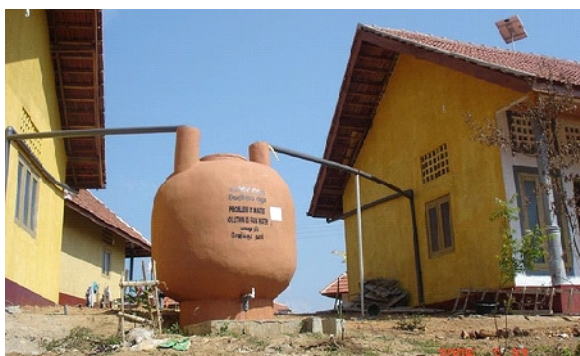
Fig.5: Capture of rain water in Sarvodaya