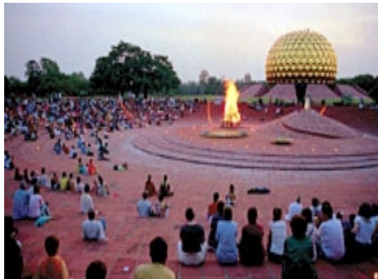
Fig.15: Peace Area of Auroville

Composting toilets and a traditional Russian sauna (Lazutin and Vatolin,2011,27-29). Currently more than 40 families