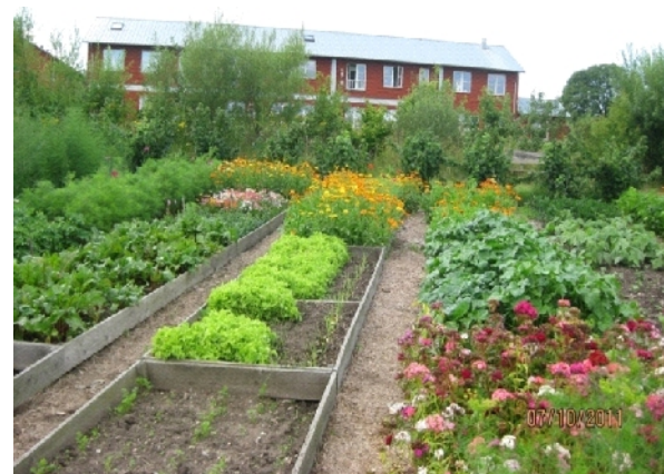
Fig.14: Gardens in Munksogaard

Community Garden in Munksogaard: Each residential dwelling in Munksøgaard has the opportunity to cultivate its own fruits and vegetables onsite (Fig.14).