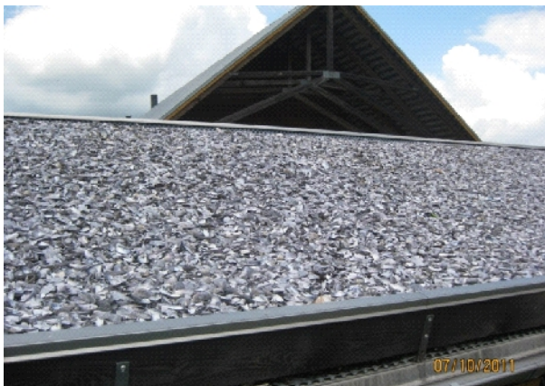
Fig.13: Use of mussel-shells in roofs of Munksogaard

Straw Insulation: This picture reveals the straw insulation that supports Munksøgaard's new community center. Instead of using traditional energy-intensive materials, Munksøgaard is committed to integrating organic, low-tech building materials into its new development projects (Ibid).