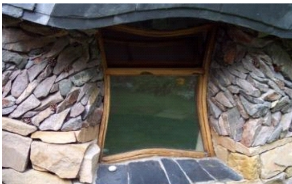
Fig.2: Type of windows in Findhorn eco-village

spreading the eco-village concept (Irrgang,2005,21; Jackson, 2004,1-6).