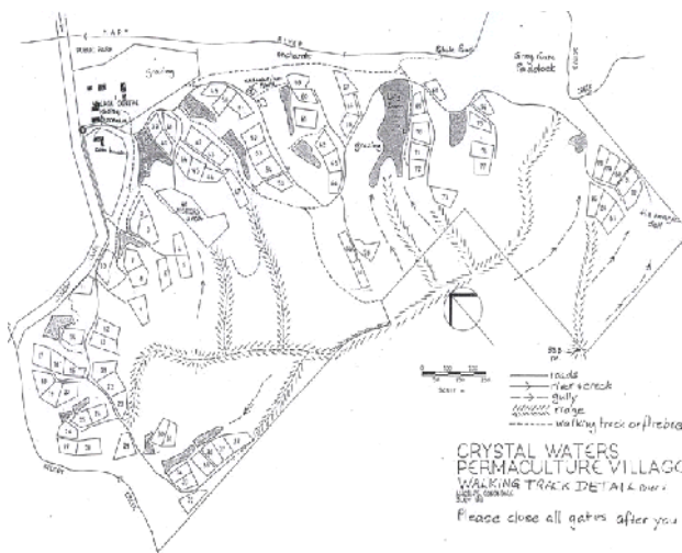
Fig.9: Crystal water permaculture village in Australia