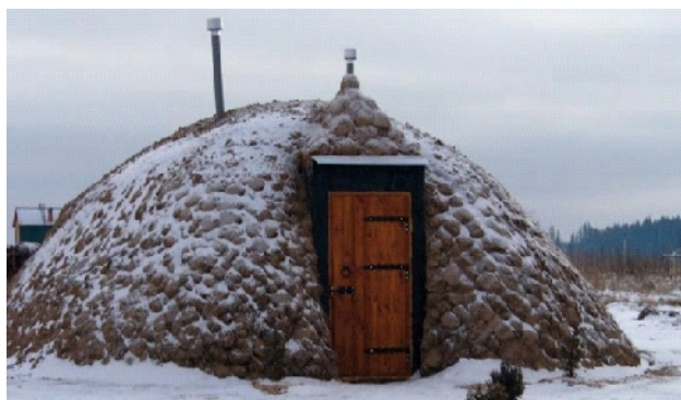
Fig.20: Cellar for winter supplies in Kovcheg

for example bamboo is used in Crystal water (Fig.21). bamboo has a lots of advantages: