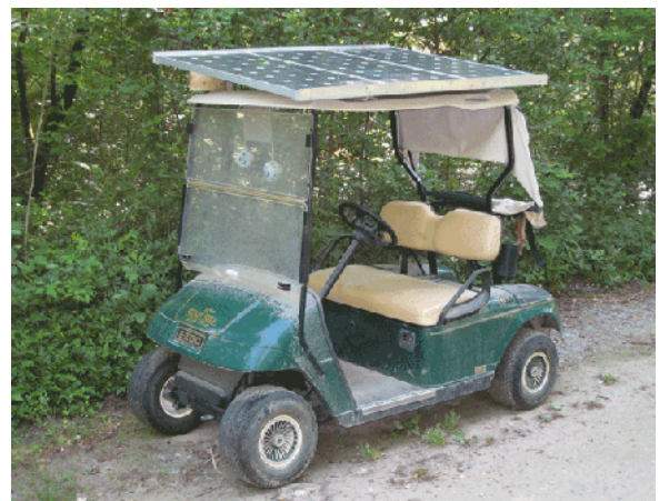
Fig.8: Golf car with batteries charged by solar panels in Earthaven