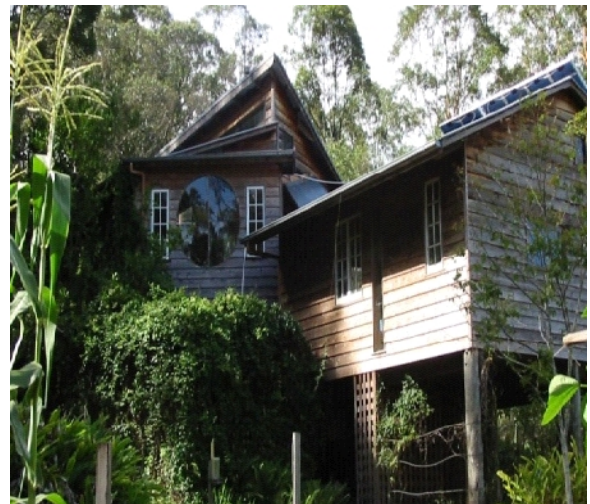
Fig.10: Solar house at crystal waters