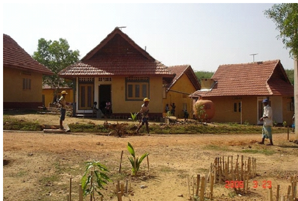
Fig.4: Sarvodaya in Sri Lanka

Crystal water: Another permaculture village is Crystal water. It is Located 100 km (62 mi) northeast of Brisbane, Crystal Waters Permaculture Village is a community of 83