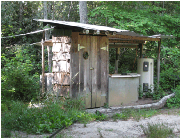
Fig.7: Hydroelectric Power Plant in Earthaven

These local waste management practices help preserve the environment by reducing transportation trips and alleviating