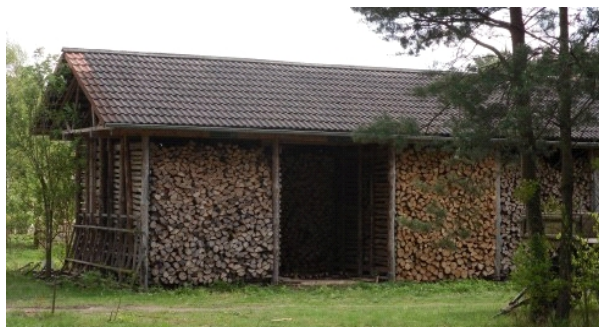
Fig.17: Fire wood from forests of Sieben Linden