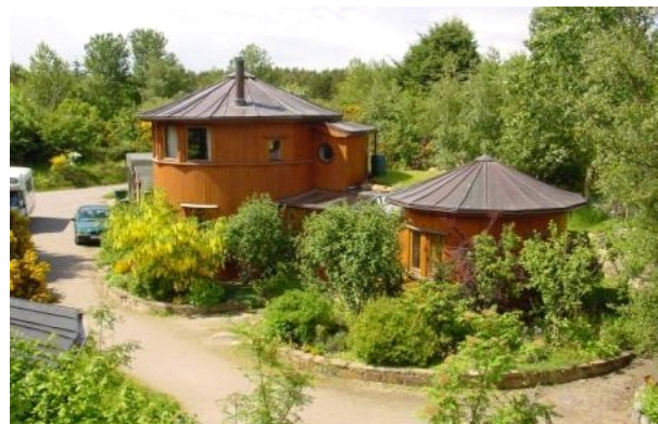
Fig.3: Some buildings in Findhorn Eco-village

Sarvodaya designed and introduced for 55 poor tsunami affected families. It was started in2006. A feature of this