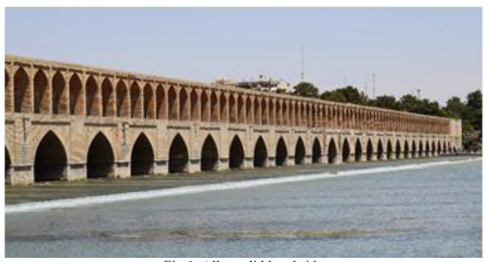
Fig.1: Allaverdi khan bridge