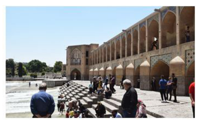
Fig. 2: A side view of the Khaju Bridge; Isfahan City

Due to the presence of its lower surface, Khaju Bridge can provide too many of these recreational functions together (Moravej Torbaty & Pour Naderi, 2014). Providing the possibility of people's presence near to the water stream and allowing them to have a sensory contact with the water flow gives the bridge a different quality compared to other urban bridges that have been constructed only for crossing over the water. The people's presence near to water flow has been possible by establishing the bridge columns on the lower floor to let them get access to each other and cross the bridge through the first floor, next to the water. The cool weather, the smooth breeze blowing over the river, the sound of water flowing under the Khaju Bridge, and the area around the river has turned it into a great urban recreational space. Moreover, the water flowing over the eastern stairs make a pleasant natural sound for the people who are passing by these areas; finally, people are possible to go down the stairs and sit by the river, touch the water surface and make a closer physical connection with the water stream and Nature. The river's landscape appearing