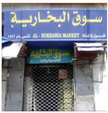
Fig. 6: Bukharia a Market, costume jewelry.