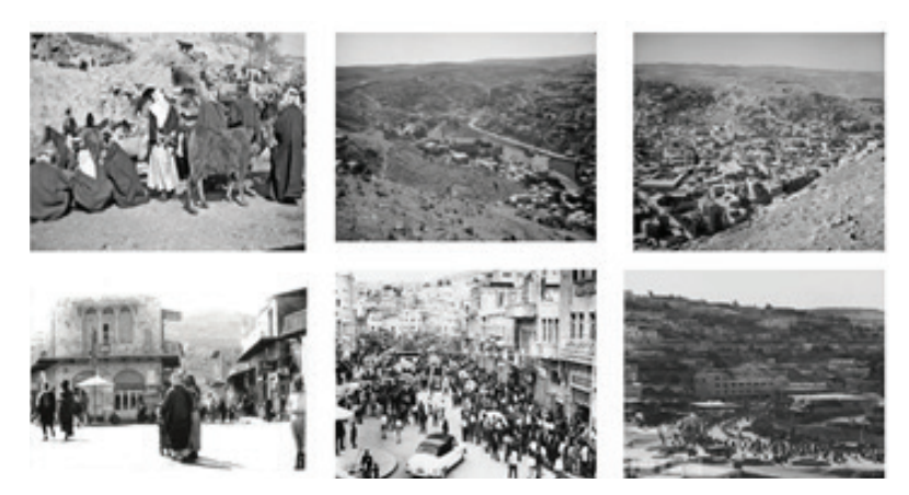
Fig. 3: Amman in (a) 1917, (b) 1927, (c) 1935, (d) 1947, (e) 1958 and (f) 1958 (Municipality of Greater Amman, 2019).

defining the shape of the city, its functions, different uses, transport lines, and other functional features in a general way. In 1964, the commune of the city began to develop alter detailed norms that subsequently contributed to the realization of the contents of the organizational charts of the territorial planning in collaboration with some experts. The unexpected increase in the population of the city, controlled by mass immigration by the population in the neighboring region of the emotive of wars, hindered the development of the old global regulatory plan of the city, despite the many tentative initiate the process of development of the global regulatory plan. It has always been hindered by the same problems of overcrowding of the population, and the presence of areas abusive difficult to control and the uncontrolled construction of government agencies especially in the abusive areas (Ababsa, 2011; Abu Al-Haija & Potter, 2013; Abu Odeh, 1999).