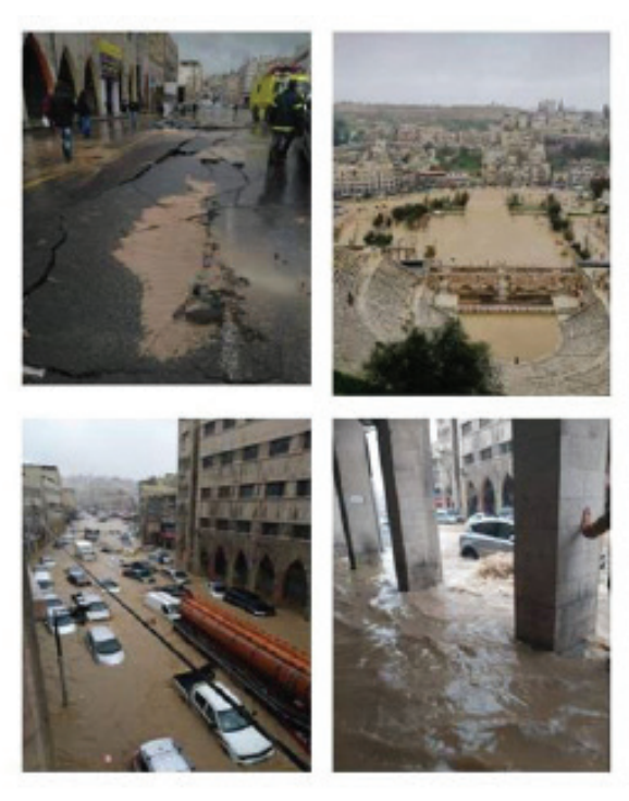
Fig. 4: Water flooding in the Downtown, February 2019

The Downtown hosts lots of landmarks of the country. For instance, Al-Husseini Mosque which is the oldest mosque in the Jordanian capital was founded by Prince Abdullah Bin Al Hussein in 1923. It was named after Sharif Hussein Bin Ali (The commander of the Great Arab Revolt in the Arabian Peninsula