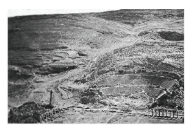
Fig. 2: Amman in 1892 showing the Roman amphitheater (Municipality of Greater Amman, 2019).