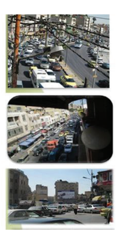
Fig.7: Traffic congestion of overlapping pedestrian movements with cars.

The historical Amman Downtown can be a worldwide attraction center if conserved. The accessibility to the Downtown of Amman and the movement within the center is very difficult due to the lack of public attitudes and the strong presence of high level visual, audio and environmental pollution such as the acoustic approach. The lack of separate movements of pedestrian and automobiles creates strong interference of traffic movements especially in the center of the Downtown streets. In addition to the invasion of sidewalks by illegal street vendors and lack of indecent signs, marks the major problem to be put forward for critical solution (Abu Odeh, 1999; Municipality of Greater Amman, 2019; Robert & Marpillero-Colomina, 2011).