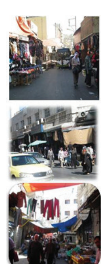
Fig. 8: Movement of pedestrians and hawkers in the historical Downtown.