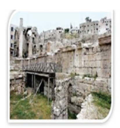
Fig. 5: the Way of Nymphaeum, Downtown, Amman.

and Levant). The Al-Husseini Mosque is 58.5 m long and 12.5 m wide. It has a front hall and two side galleries. In the middle is a heavenly square, two minarets that rise right 70 m and the left 35 m. the grand Mosque of Husseini is considered the first urban project to build in Amman. The building started in 1924 and was completed in 1927.