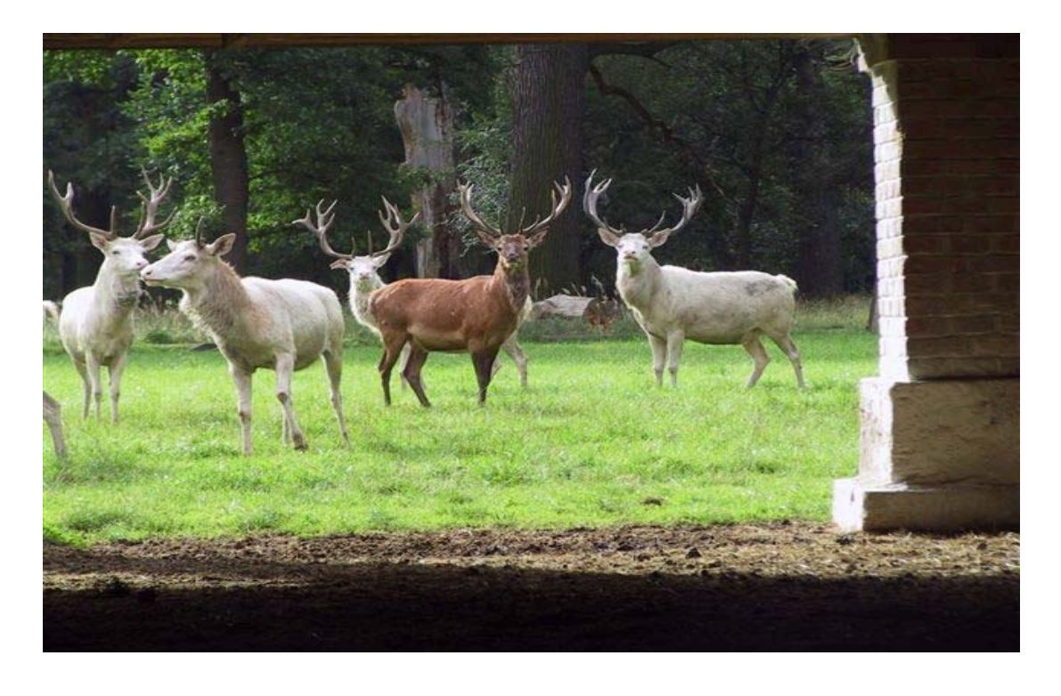
Figure 3 Color variations in individuals of Cervus elaphus from game preserve Žleby