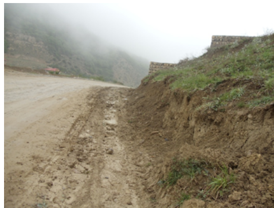
Figure 1: An example of a damaged road verges in Ziarat catchment.

According to land use, five sites were sampled including forest, arable lands, pasture, road and