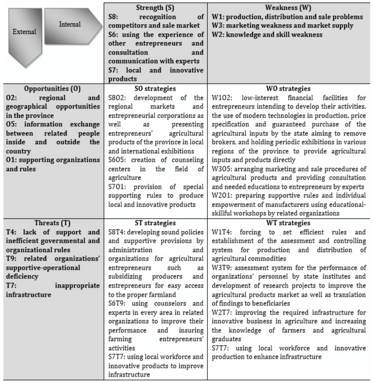
Figure 4. Strategic matrix for the development of agricultural entrepreneurship activities in Kermanshah Province

degree of alternative strategies in order to choose the best strategy. According to the weights calculated, the aggressive or developing strategy (SO) with the final priority of 0.347 was selected as the best strategy for the development of agricultural entrepreneurship in Kermanshah Province. The Conservative or Revising Strategy (ST) was also selected as an alternative strategy with a final priority of 0.70 (Table 4).