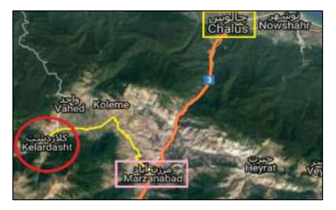
Fig 2: regional situation of Kelardasht