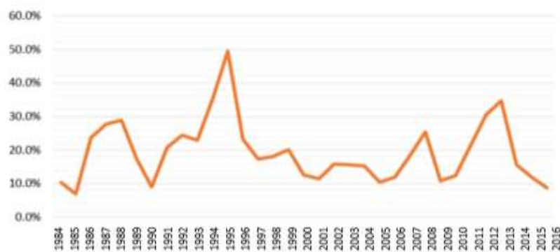
Fig. 1: Diagram of Iran's Inflation Rate During 1984-2016 [13]

have positive or negative effects on funds. Inflation rate is the rate of change in the price index in each periods compared to the previous period. In Iran, inflation affects various sectors disproportionately, causing relative price changes (Fig 1 [13]). As an economic phenomenon, inflation has always been a concern of authorities and economic experts. Moreover, the anticipation of inflation in economic policymaking is an extremely sensitive subject. Therefore, increasing the accuracy of quantitative predictions and their integration into judicial criteria is essential to economic investment. Most governments and central banks formulate and implement their fiscal and monetary policies not solely based on the status quo, but also based on the short-term and long-term forecasts of key economic variables, such as inflation. Evidently, the predictive accuracy of these variables plays a key role in the success of the related policies regardless of the correctness of fiscal and monetary policies and their relevance to the existing conditions [14].