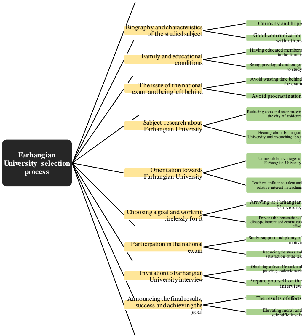
figure2. Representation of main themes and categories