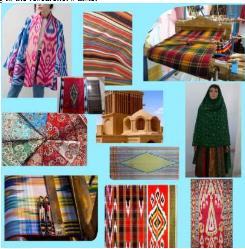
Figure 1- Storyboard

The implementation of the practical part of the project began after studying and knowing the history and characteristics of the art of simplism by preparing images of subjects related to this art, especially simplistic works in the field of fashion, and preparing a storyboard. Based on the title and purpose of this research, images of some traditional fabrics have been included in the design for inspiration and integration with other images, which were chosen only according to the researcher's taste.