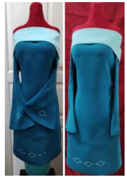
Figure 9- The final stitching of design number (1)

In this design, it has been tried to use minimum cuts and motifs according to the characteristics of minimal, which is based on simplicity, and also in choosing the color of these clothes, the colors of the poetry fabrics, which are traditional fabrics of Yazd, have been used. Additions and colorful items should be removed and replaced by one hand and one color.