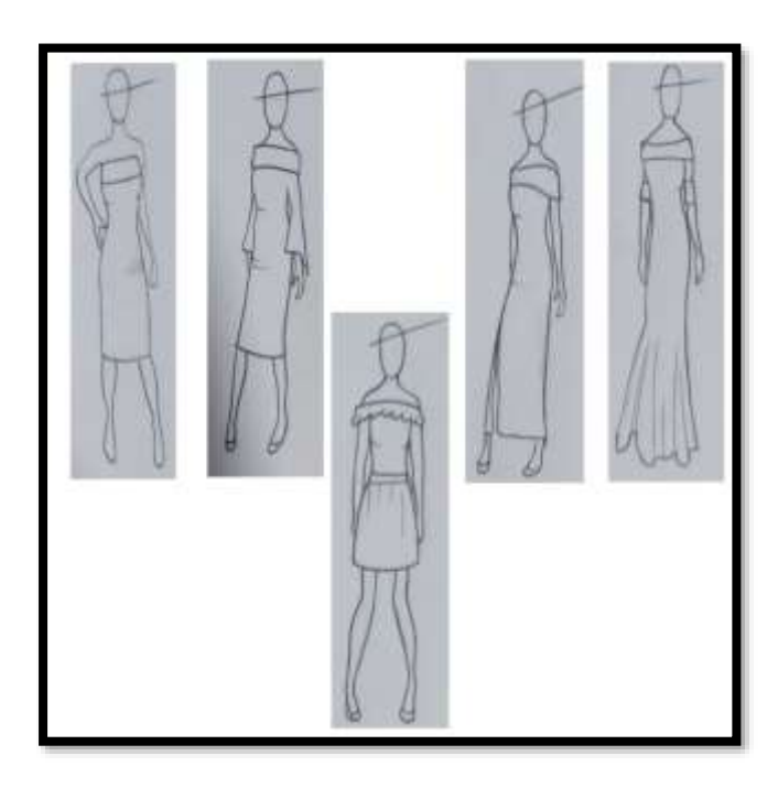
Figure 3- Approved etudes

After the completion of pattern making, the required amount of each color and type of fabric was calculated in the most ideal arrangement of the pattern pieces to consume less fabric and the smallest distance.