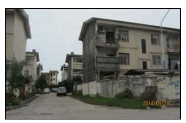
Figure 1. Chaharsad Dastgah complex