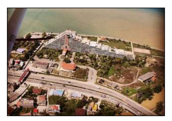
Figure 3. Daryaye Chaloos complex