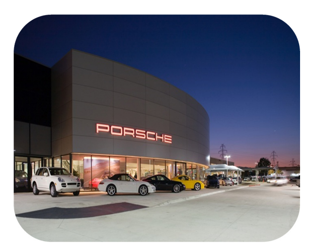
Figure 4. Exclusive distribution