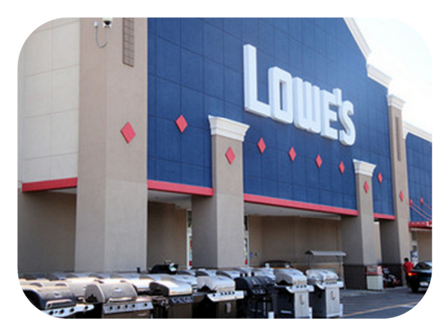
Figure 3. Selective distribution-Retailer such as Lowe's are commonly utilized in selective distribution for large appliances. (Berman, 1996)