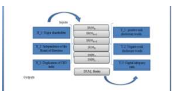
Fig 1: Data Envelopment Analysis Model

Inputs included: major shareholder, board independence, the duality of CEO duties. Outputs included: positive risk disclosure words, negative risk disclosure words, capital adequacy ratio. In the present study, the variable assessed was risk disclosure. First, financial reportings were evaluated for the first level of critical discourse analysis based on Norman Fairclough's model, followed by assessing the text in terms of disclosure of positive or negative risk words.