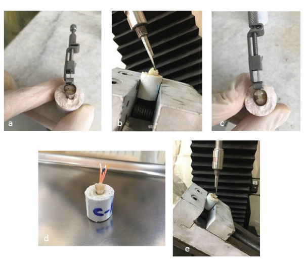
Figure 1. a) Prepared tooth ready for restoration b) Tooth under load c) ribbon fiber placement d) RCT-Obturation e) Tooth fracture at the end of test

To restore the teeth, gutta-percha was removed from the pulp chamber at a level 2 mm from the canal orifice. All glass-filled areas were treated with 20% polyacrylic acid as a cavity conditioner for ten seconds. Then Fuji II LC Gold type glass ionomer cement (GC-Japan) was placed on the gutta-percha as a MOD restorer (20) (Figure 1a).