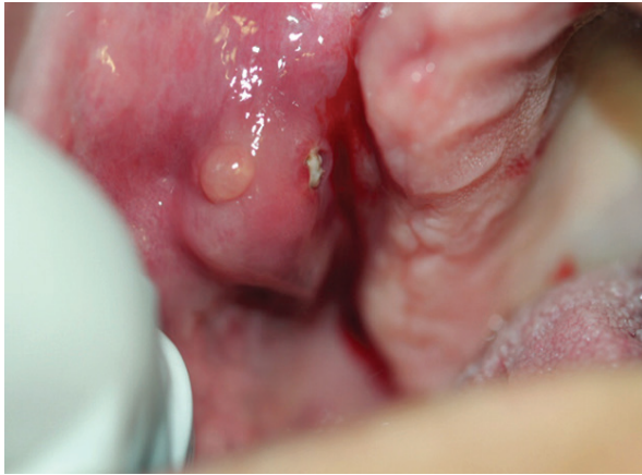
Figure 1. Tumor-like lesion in buccal mucosa