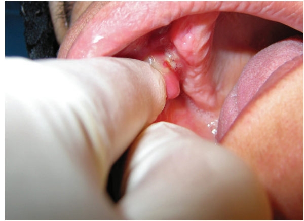
Figure 2. Purulent discharge in palpation