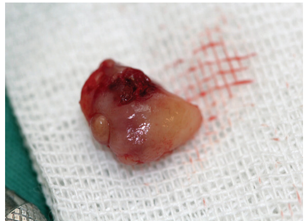
Figure4. Tumor-like lesion was removed by scalpel