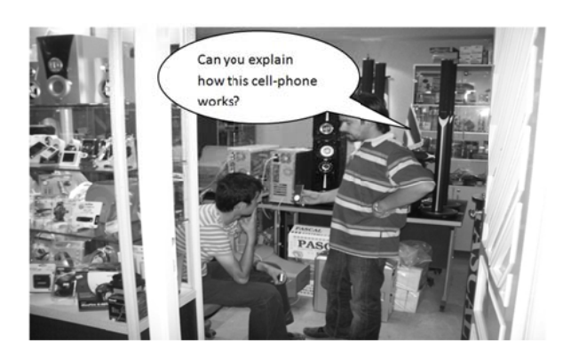
Figure 1. An example of an experimental picture used in the experiments. In this picture a young man is showing a cell-phone to his friend and is asking about how the cell-phone works.