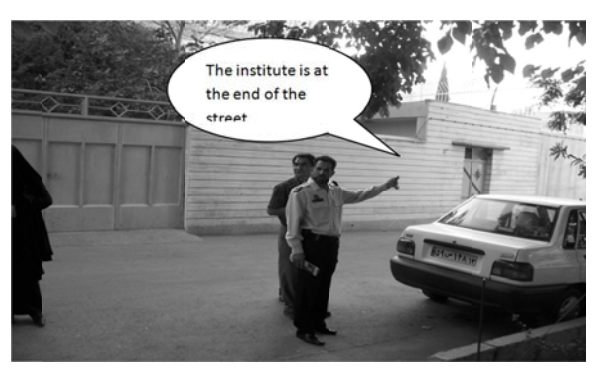
Figure 2. An example of a filler picture used in the experiments. In this picture a police officer is giving directions to someone.

In addition to the experimental pictures, another set of pictures (N = 25) was used as fillers. The rationale for choosing the fillers was to hide the purpose of the study. In fact the experimenter wanted to make the participants believe that he was interested in investigating the types of structures people used in different situations. Like the experimental pictures, the fillers depicted a scene where people were seen to be involved in some sort of conversation. For example, a police officer is giving directions to people, or while someone is watering the fowers another person is talking about the weather and the fowers. Similarly, the sentences were portrayed by means of balloons. For example, in the following picture a police officer is giving directions to someone.