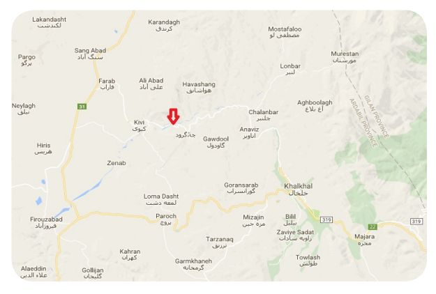
Fig. 2. The geographical map of the plant ( Reseda luteola ) in the sampling area.

After removing hexane using rotary evaporator, the oily mixtures were derived to their methyl esters according to the general guidelines given by the International Olive Oil Council (IOOC) (http:// www.internationaloliveoil.org) and IUPAC (Ulberth and Haider, 1992) reports by the transesterification process. In this process, dried n -hexane extracts were again dissolved in hexane and then extracted with a methanolic solution of KOH (2.0 M) at room temperature for 2 min. The upper phase was subsequently analyzed by means of GC/FID and GC/ MS systems.