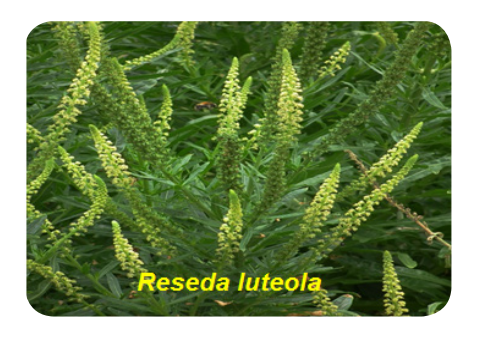
Fig. 1. The photograph of Reseda luteola L.

The seed parts of Reseda luteola (Fig. 1) were collected from Khalkhal area, Ardabil province (Fig. 2) in August 2016 in northwest of Iran at an altitude of 1550 m. A voucher specimen (No: 027) has been deposited at the Herbarium of the Agriculture Research Centre (A.R.C.) Ardabil, Iran.