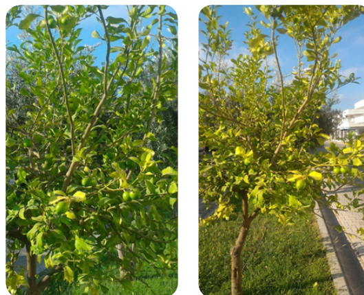
Fig. 1. Lemon trees at early period (left) and at late period (right) show the seasonal differences.

Fig. 2 (Demirtas et al., 2013). The aqueous extract was separated by filtration and extracted with ethyl acetate. This process was continued until significant amounts of the aqueous components were transferred to ethyl acetate. When this process was carried out three times, the extraction was completed with ethyl acetate. The remaining aqueous extract was subjected to extraction in the same manner as n -butanol. The obtained ethyl acetate and n -butanol extracts were separated from the solvent by rotary evaporator to give a dry crude extract. Eventually, 13.2 g of ethyl acetate and 21 g of n -butanol crude extracts were obtained from the lemon pulp.