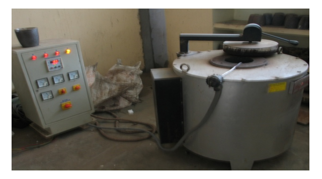
Fig. 2 Electrically heated crucible furnace

In this work Aluminum is heated in an electrically heated crucible furnace as shown in Fig. 2. Aluminum is held with a special metallic alloy heating element in a crucible furnace and electrically heated. Here in this research work, a special metallic alloy heating element is used which provides more surface area, in turn radiating more heat. Thus, heat is better utilized and energy is saved. It can hold 50 kg aluminum, with 32KW connected load. It provides homogenous temperature all through the inside cavity of the furnace, achieving thermal balance and prolonging the operational life of furnace linings, heaters & crucibles. The furnace is connected & operated at lower voltage; it is connected with 60-80-100V, using Step down Transformer with three tapings.