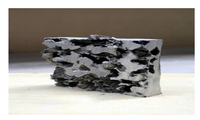
Fig. 5 Soaked Precursors at 850°C (using aluminum net)