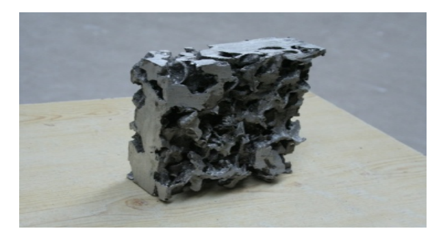
Fig. 6 Soaked Precursors at 850°C (using steel net)

Using open die, experiments were conducted with Soaked Precursors at 950°C as shown in Fig. 7 then by using Soaked Precursors at 910°C as shown in Fig. 8.