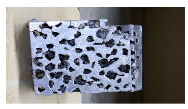
Fig. 7 Soaked Precursors at 950°C

Using open die, experiments were conducted with Soaked Precursors at 950°C as shown in Fig. 7 then by using Soaked Precursors at 910°C as shown in Fig. 8.