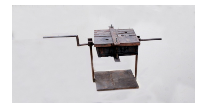
Fig. 3 Picture of Rotating die

In this experiment two types of dies were used for mixing the cores with aluminum after melting the aluminum at various temperatures namely an open die and a rotating die. Here the open die was made of Ms plate 4 mm thick with dimensions of 200 X 200 X 40 mm. Then the rotating die was made up of Ms plate 10 mm thick with dimensions of 175 X 160 X 50 mm. The rotating die is depicted in Fig. 3. Experiments were conducted with Soaked Precursors at 850°C as shown in Fig. 4; then again Soaked Precursors at 850°C by using aluminum net as shown in Fig. 5 and steel net as shown in Fig. 6.