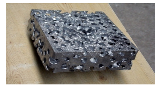
Fig. 10 Porous castings at 910°C

The sand balls were prepared with 6-10% of bentonite and 2-6% of moisture with silica sand as the normal clay. The AFS content required is 6-10% in the foundry for green sand system. Sand balls of various sizes ranging from 15 mm – 45 mm were made manually by hand, where the picture of sand balls is shown in Fig. 11.