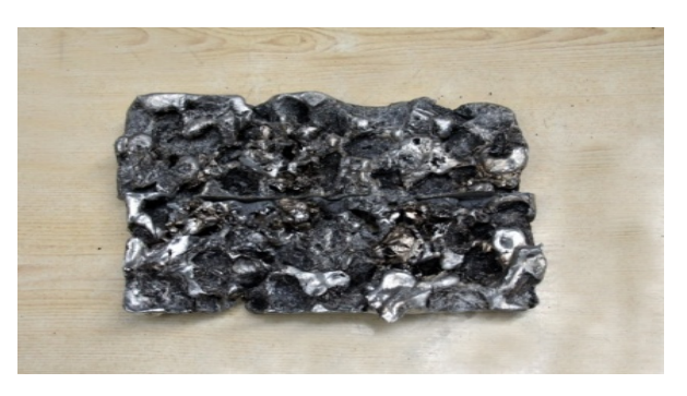
Fig. 4 Soaked Precursors at 850°C

In this experiment two types of dies were used for mixing the cores with aluminum after melting the aluminum at various temperatures namely an open die and a rotating die. Here the open die was made of Ms plate 4 mm thick with dimensions of 200 X 200 X 40 mm. Then the rotating die was made up of Ms plate 10 mm thick with dimensions of 175 X 160 X 50 mm. The rotating die is depicted in Fig. 3. Experiments were conducted with Soaked Precursors at 850°C as shown in Fig. 4; then again Soaked Precursors at 850°C by using aluminum net as shown in Fig. 5 and steel net as shown in Fig. 6.