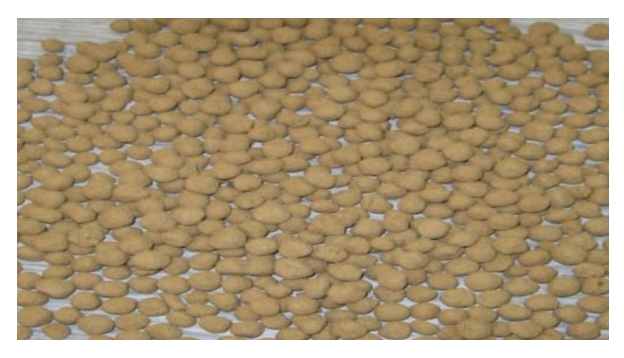
Fig. 11 The picture of sand balls

The sand balls were prepared with 6-10% of bentonite and 2-6% of moisture with silica sand as the normal clay. The AFS content required is 6-10% in the foundry for green sand system. Sand balls of various sizes ranging from 15 mm – 45 mm were made manually by hand, where the picture of sand balls is shown in Fig. 11.