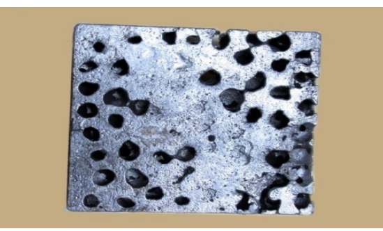
Fig. 9 Porous casting at 950°C

some superheating of the melt or preheating of the granules can be used in advance. This process has been used not only with aluminum, but also with magnesium, zinc, lead, tin and cast iron, and it allows casting of parts with intricate shapes. The picture of porous aluminum castings is shown in Fig. 9 at 950°C and in Fig. 10 at 910°C.