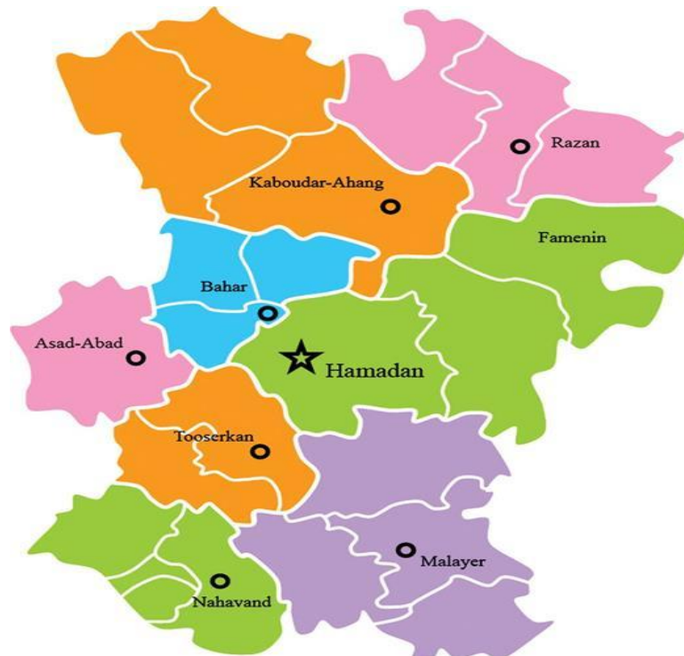
Map 1: map of political divisions of Hamedan province

Malayer city as the second city of Hamedan province has a population of 297/062 people and a breadth about 3210 square kilometers, Malayer city is placed in east-south of Hamedan province and in proximity of Nahavand and Toyserkan and Hamedan metropolis and Arak and Boroujerd of Markazi and Lorestan province. Malayer city position and bridth Malayer city with area of 3210 square kilometers from 16/89 percent of Hamedan province and is placed in south-east of this province and is adjacent with Tooyserkan and Nahavand (west) and Hamedan (North) and Boroujerd-Lorestan (south) and Arak-Markazi province (east)