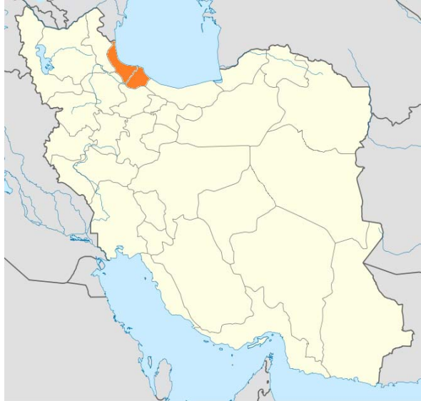
Fig. 1: Gilan Province