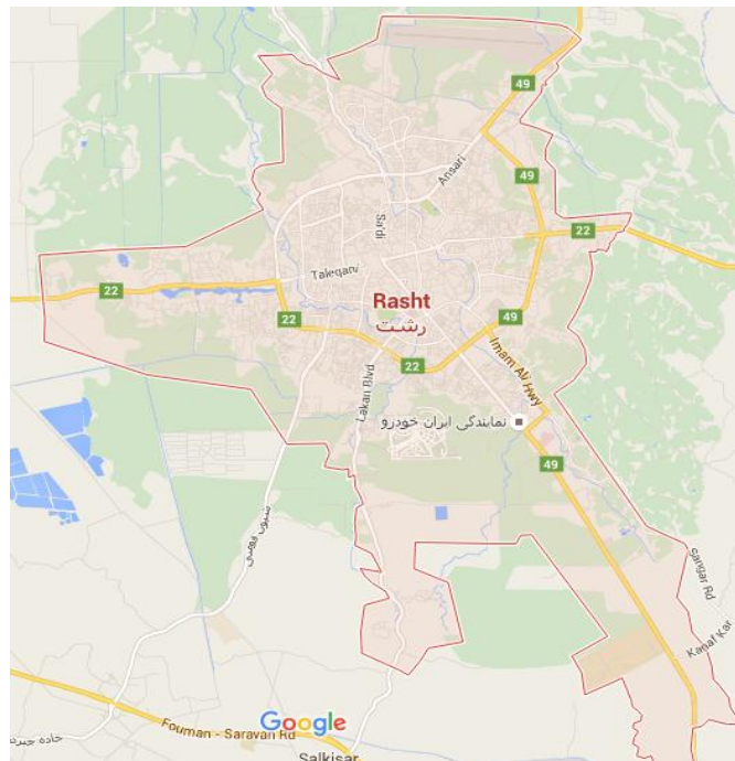
Fig. 2: Rasht City