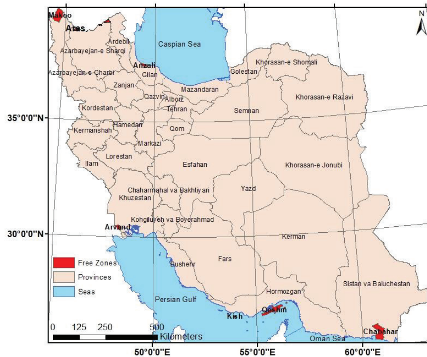
Figure 1: Location of the Arvand Free Zone in Iran

Arvand Free Zone in the northwest of the Persian Gulf with an area of 37,400 hectares in the northwest of the Persian Gulf, including the cities of Abadan, Khorramshahr and Minoshahr (Mino Island), which is located at the confluence of the Arvand River and Karun. This region is adjacent to Iraq and Kuwait and has a special importance with its capacities such as road, rail and air transportation. Figures 1 to 3.