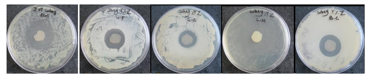
Fig. 1. Inhibition zones of Whey protein isolate films incorporated with 2% zataria multiflora Boiss. essential oil on Listeria monocytogenes (L.M), Bacillus cereus (B.C), Staphylococcus aureus (S.a), Escherichia coli O157: H7 (E.coli) and vibrio parahaemolyticus (V.P)