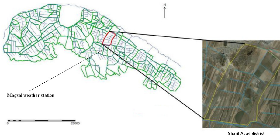
Fig. 1: The study area