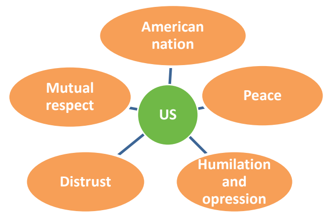
Figure (1): The signifiers gathered around the signifier of America in Khatami's dialogue