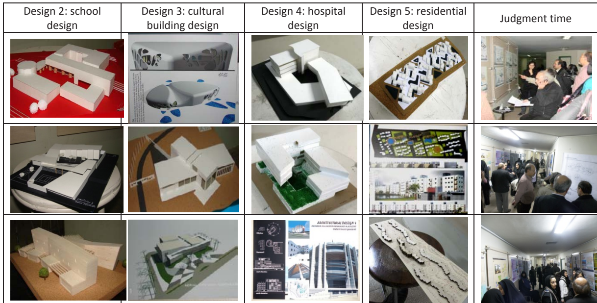
Fig. 4: Results and products of four design studios and their judgment procedure