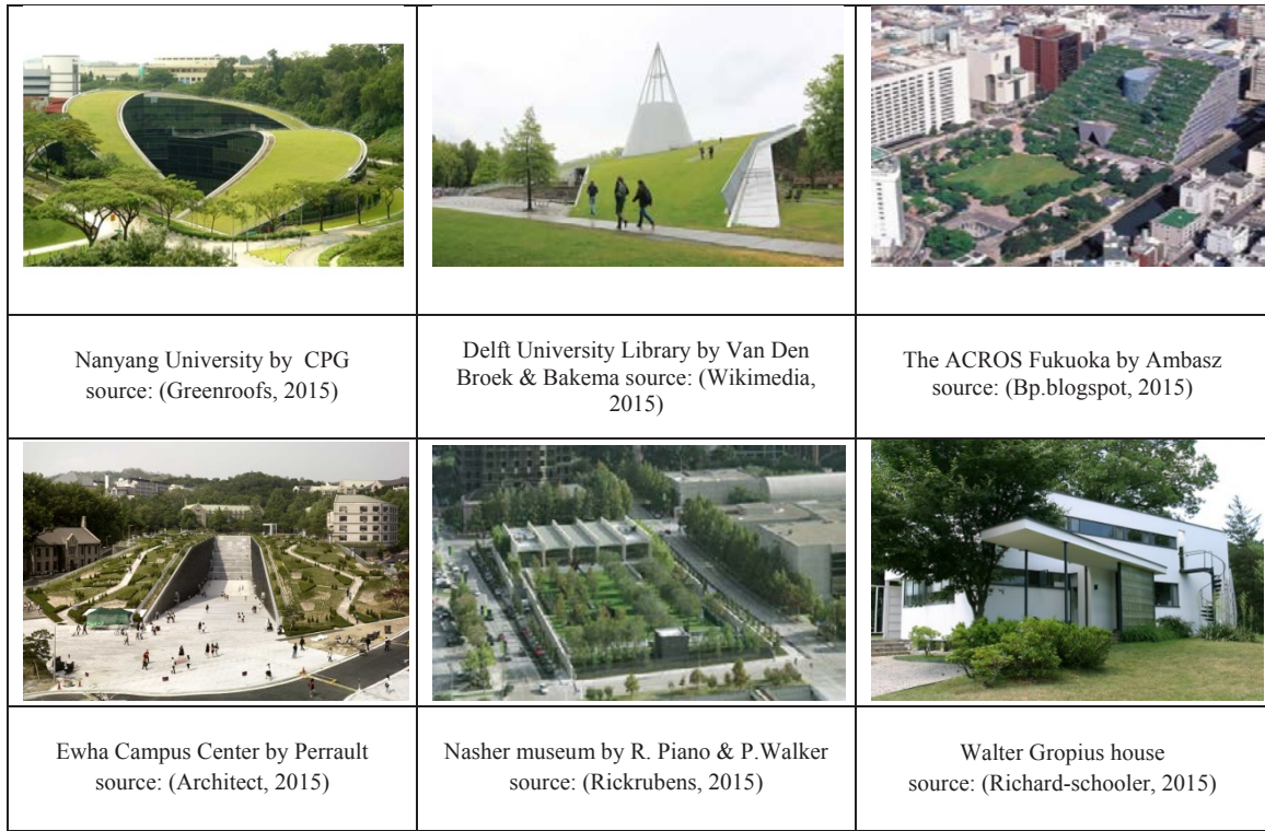
Fig. 3: Some built environments with connections to their surrounding and context by famous designers