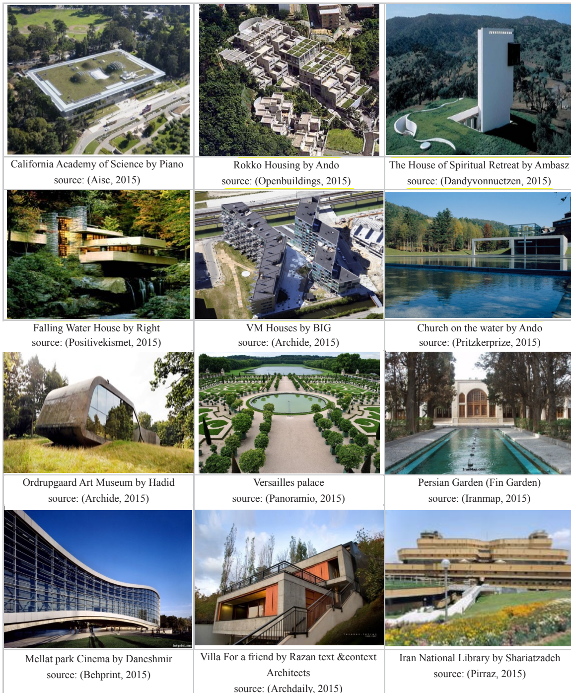
Fig. 2: The selected designs by students regarding interaction between building design and its context

humankind's historical role in the shaping of site. The primary elements of landscape -those of geological and ecological process, climate, and even human intervention- were each engaged equally as formative influence on the building and site. In these projects, the physical and pictorial layering of space in the landscape does not create distance between