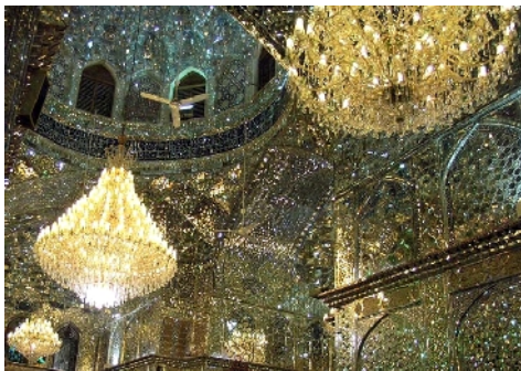
Fig. 3: Mirror's game in the sacred space, Shâh-e Cherâgh, Shiraz

From this point of view, the meanings of beauty and ugliness could be defined as well. Getting approach to God gives one the power of seeing him more and more unveiled as the most beautiful being. The ultimate measure of beauty is completely revealed with no hidden point in presence of God, the highest place of heaven that is called the Truth of Mohammad, the Perfect Man. One who tries to actualize the granted power in her/his heart will be honored to be accompanied by God in the promised paradise 1 . So the residents of Heaven are allowed to see the divine beauty, the absolute beauty. Accordingly, the knowledge is equivalent to conceiving the beauty. As much as the former goes higher, the latter follows it exactly as specified. Thus dwelling in Heaven means to gain the ultimate knowledge in order to obtain the ability to see the beauty (Fig.4).