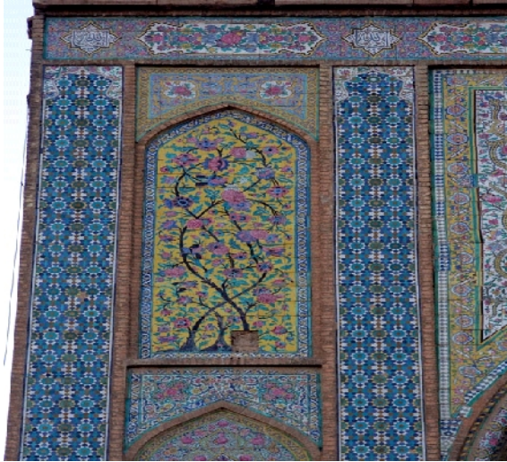
Fig. 7: Tree of life on the tiles of the Ivan of Masjed-e-Vakil, Shiraz