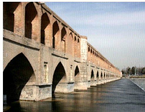
Fig. 6: Si- o- Si Bridge, Isfahan