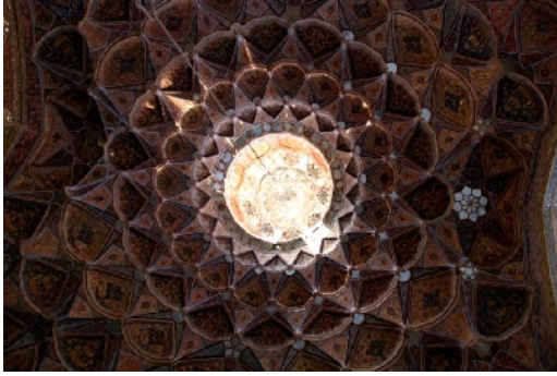
Fig. 1: Allah is the light of the Skies and the Earth, Hašt Behešt, Isfahan