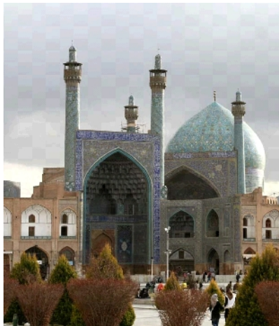
Fig. 5: the tree aspects of The Truth as the Tree of Life with its two guardians which is realized as the gate or the dome with two minarets, The Mosque of Imam, Isfahan

Mohammad is the one who extends from the embodied human on the earth to the Heaven, the God; a historical person as the Prophet to the Perfect Man as the source of being. Now we reach another element of Heaven: bridge as a road from earth to Heaven that is called Chinwad puhl in Zoroastrianism and Serqt in Islam. In Sufism, the Perfect Man is the straightway from earth to Heaven who is no one but Mohammad. Here a similarity between Mohammad and the bridge (33 Bridge) may be observed again. Lotus is a mediatory being between clay, water and light as the source of life. Hence it is