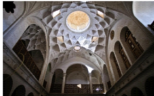
Fig. 4: The House of Ameries, Kashan