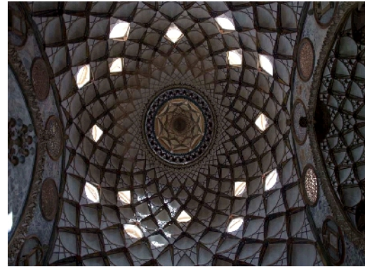
Fig. 8: the Great Sun in the circle of prophets, on the ceiling the house of Boroujerdies, Kashan

representative of eternal response of human to “the god question.” 4 This means final return to the main homeland, the Heaven.