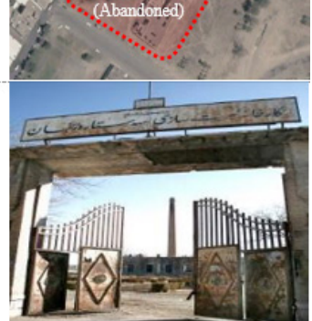
Fig. 1: Location of match factory (Source: Google map)