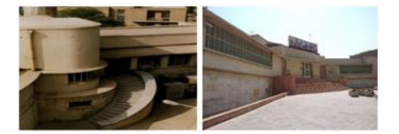
Fig. 4: National bank building facade of Abadan.

(Figure 3). National bank building, the first and old building was built in 1930 and the new one was built in 1970. Both of them have two floors and a barrel-vault. The national bank building of Abadan consists of two new and old modern concentrated cylinders with two diagonal cubic rectangles. The building has two entrances in the parallel street of municipality and Taleghani. In 1990, after the imposed war of Iran and Iraq, many reformations were done in the damaged parts. The facade of both buildings is made of stone and has no embellishments. There are some windows around the old building. The facade of the new building has many windows and vertical radiation at the top and some white shield between windows (Figure 4).