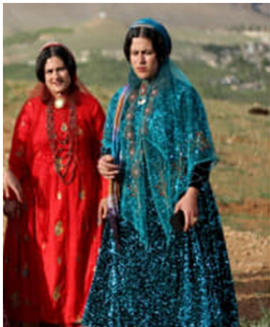
Figure 3: Kuwing (Dress)