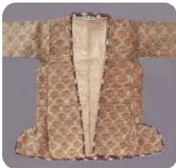
Figure 4: Kulja (Jacket)