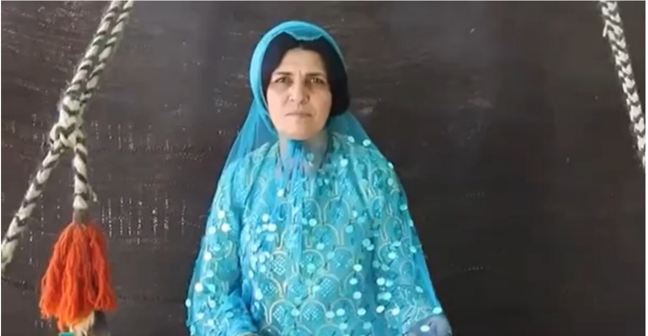
Figure 1: A Qashqai woman wearing a Lechek (headscarf).