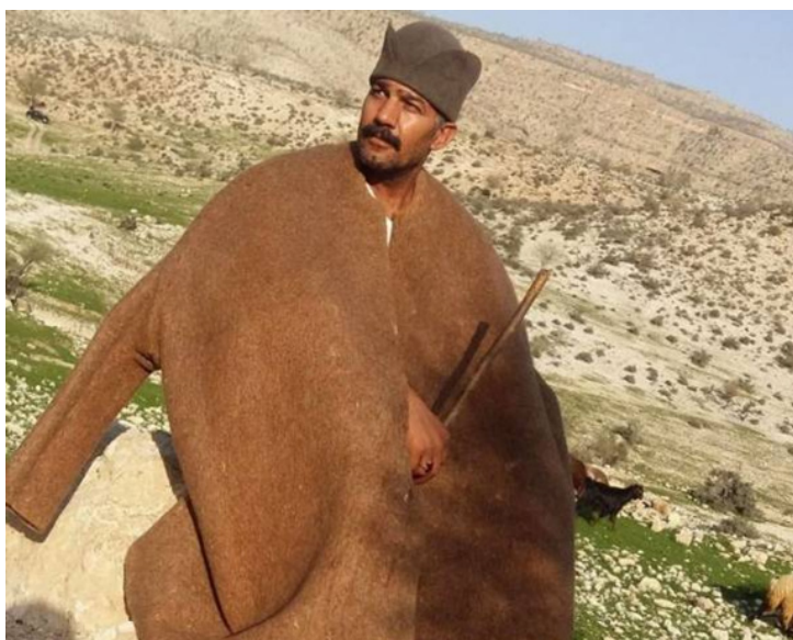
Figure 7: The Qashqai man wearing an arkhalig.