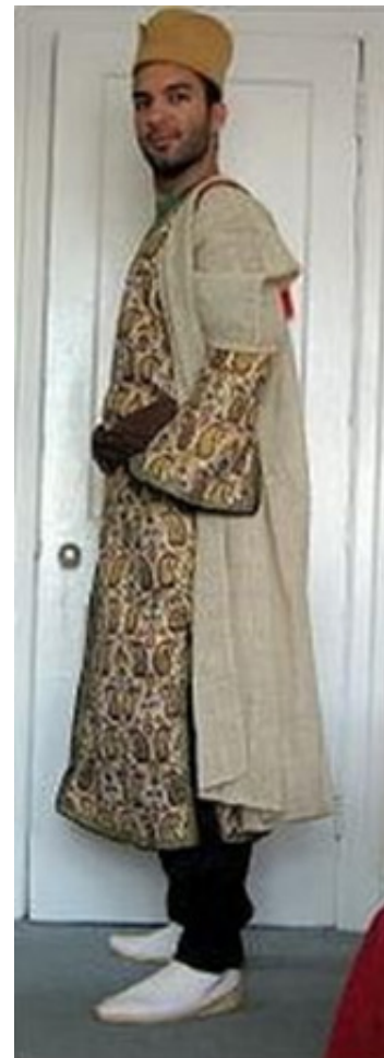
Figure 11: Trousers