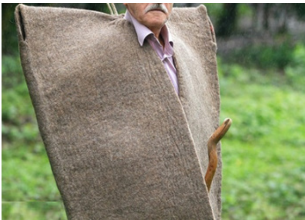
Figure 10: Kopank