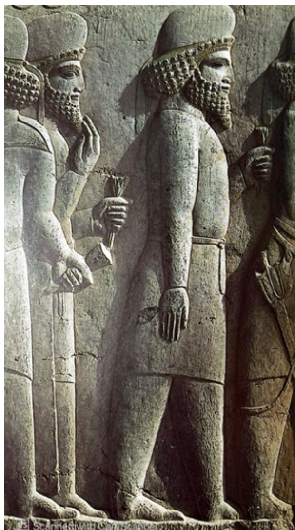
Figure 15: Median man, Persepolis relief