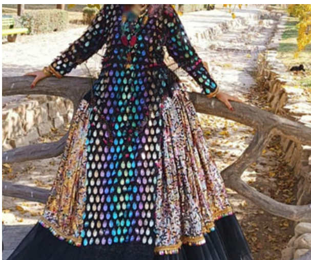
Figure 5: Tonban-Skirt