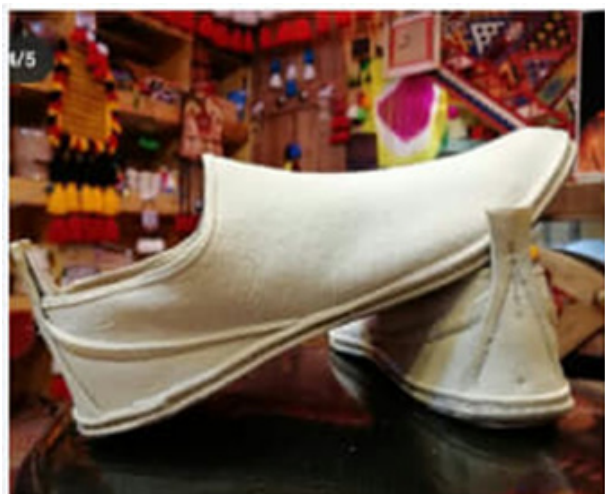
Figure 12: Kolesh - Givoh