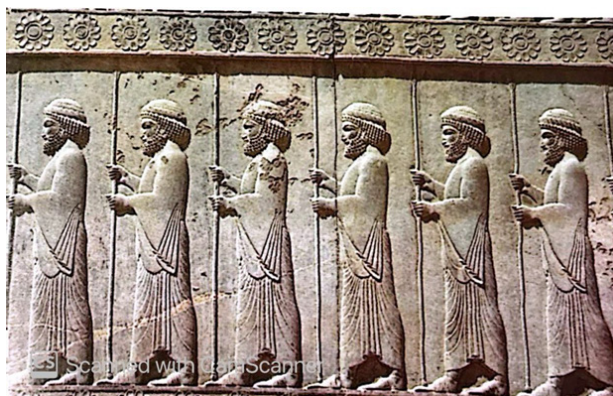
Figure 14: Persepolis petroglyphs