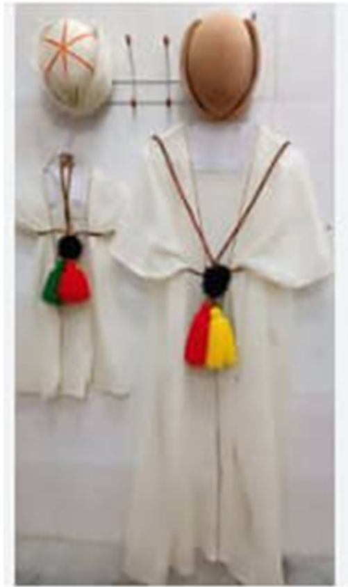
Figure 8: Shirt and Zenahare