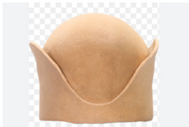
Figure 6: Felt hat