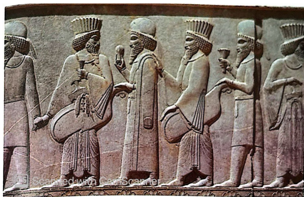
Figure 16: Other ethnic groups in the Persepolis relief