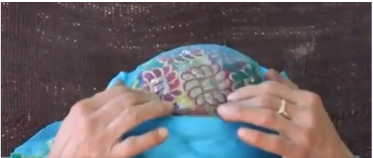
Figure 2: Al Baqi (Headband)